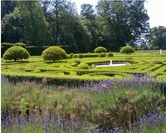
Parterre at Tythrop House.