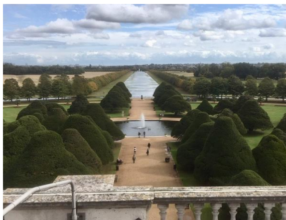
The Fountain Garden