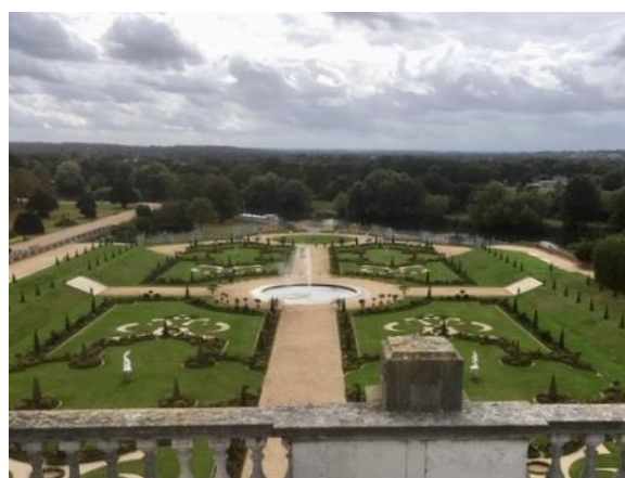
The Privy Garden