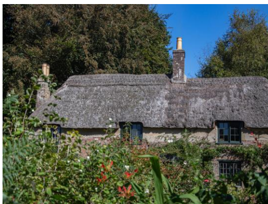
Hardy's Cottage.

We paid a brief visit to the secluded birthplace of author Thomas Hardy (1840–1928), a thatched cottage sitting in a hollow surrounded by tall trees and high hedges, with a relatively new visitor centre nearby. Built by Hardy's great-grandfather in 1800, the Cottage remains largely unchanged externally and now resides in the care of the National Trust. Internally, its small rooms are fitted out with furniture and fittings from the period to give a flavour of the family's life there.