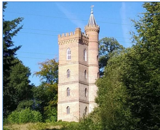
The Gothic Tower at Painshill

The current status is that the Development Consent Order (DCO), which includes the current plans, has been approved and this is now being reviewed by the Planning Inspectorate (Reference TR010030). There are still other points of issue to debate along the way but we are hopeful of a positive outcome which is anticipated for autumn of 2020.