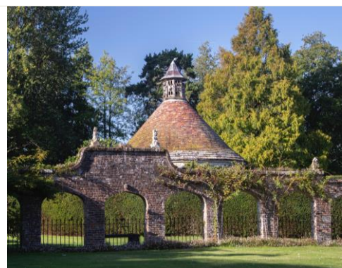
Athelhampton House.

Thomas planned four rectangular enclosures with coordinated vistas, the central pivot being the Corona Garden with its cirlet of obelisks, admired by Gertrude Jekyll. What has been lost is a large enclosure north-west of the house, balancing the Private Garden and in line with it. Also missing is planting detail, especially in the Pyramid Garden, where the twelve topiary yews originally punctuated a four-square pattern of rose beds. The yews have grown imposingly, but without sufficient staff to maintain the beds the pyramids now stand alone on grass. On the other hand, gardens have been developed to complement the north-east extension of the house built in the 1920s. A White Garden was made in the 1960s in memory of the wife of owner Robert Cooke and a straight canal on axis with the Private Garden was added in 1969–1970. An Octagonal Cloister Garden, with pleached limes surrounding a central pool, was created in 1971 to act as a link between the White Garden and the large kitchen garden to the south-east, recently restored.