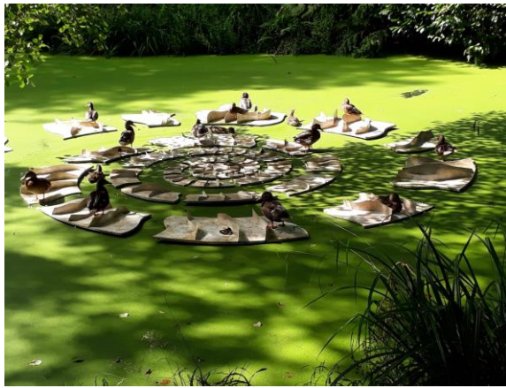
'Ammonspiralite' by M. Hodgkinson and W. Foot at The Hannah Peschar Sculpture Garden.

On our arrival at The Hannah Peschar Sculpture Garden , curator Vikki Leedham explained that the philosophy of the garden was to be at one with nature. There are no herbaceous borders nor any hard landscaping but broadleaved plants and mature trees surrounding areas of water provide the framework and enhance the changing collection of sculptures. This garden is about texture, shades of green, shadows and reflected light. The 15 th century Grade II listed cottage nestling by the side of a pond is the only permanent architectural structure.