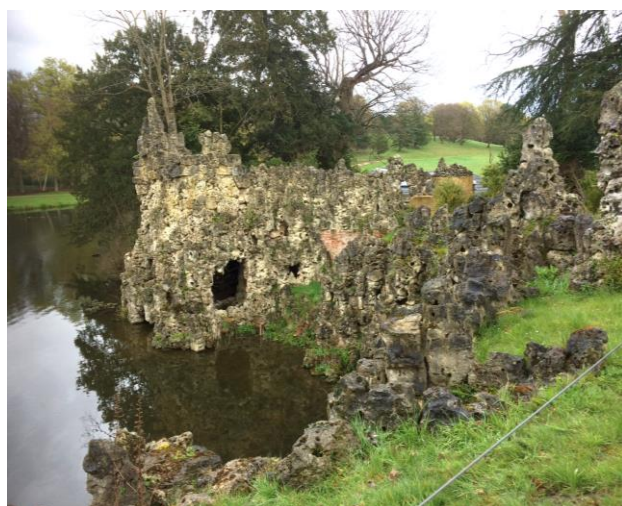
The Grotto, Painshill in 2016

Sadly, Painshill was sold off and split up at the end of World War II. In 1964 the local historian David C. Taylor started the 'Save Painshill' campaign and the project to rescue Painshill began in earnest in 1981. To save money, Hamilton had built in non-durable materials, using wood instead of stone and even plaster and papier maché for the Temple of Bacchus for example. By the 1980s, the land was overgrown and all of the buildings and features were ruined or in serious decay. At the time, Painshill was in the forefront of combining archival and archaeological research for restoration. Surveys were undertaken, archaeological digs commissioned and contemporary paintings and plans studied to try to establish how to restore the site. Just to recover the vineyard took serious land clearance and renovation of the soil. Slowly over the years features such as the Gothic Temple,